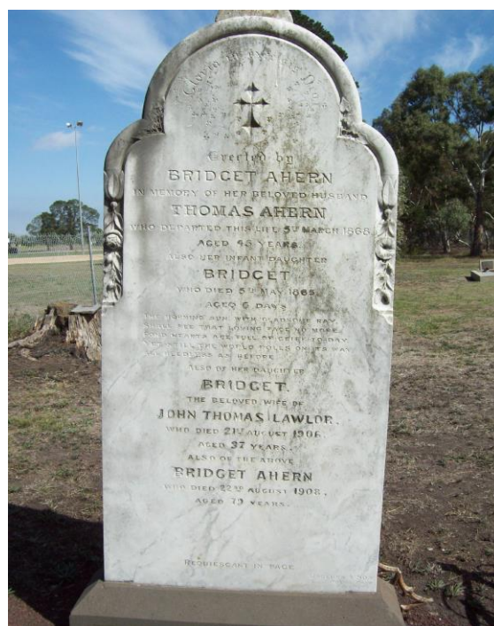
Gravestone at Epping Cemetery